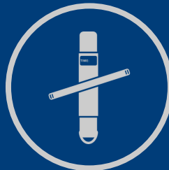
Tourniquet Application Trainers