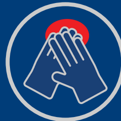
Tabletop Trainers for Classrooms