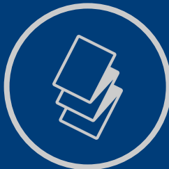
Simulated Hemostatic Gauze